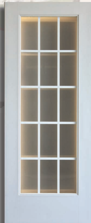
FIFTEEN LITE GBG FLUSH GLAZE