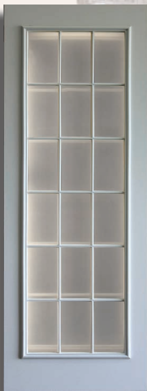
FULL LITE 18 LITE INSERT