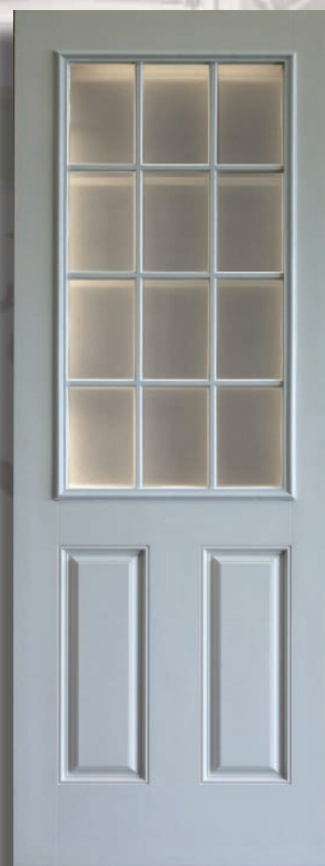
1/2 LITE 12 LITE INSERT

ALSO AVAILABLE IN 3/0 X 8/0 AND TEXTURED WOOD GRAIN