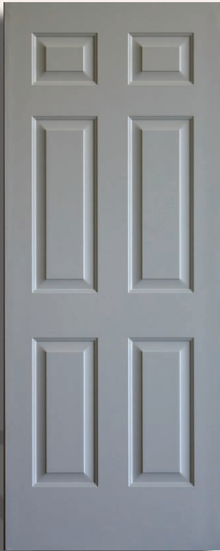
2/8 x 6/8 SIX PANEL