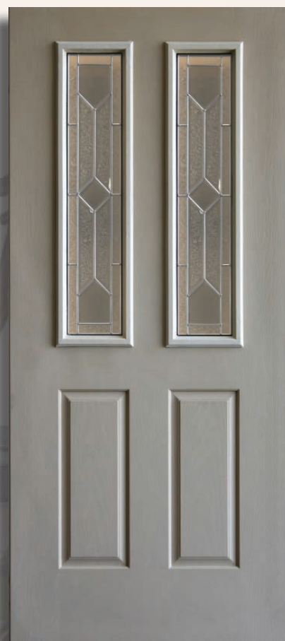
FC43 TWIN LITE CRYSTALLINE ZINC IG INSERT