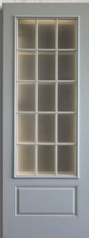
3/4 LITE 15 LITE INSERT