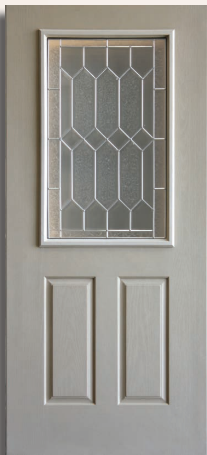
FC45 1/2 LITE CRYSTALLINE ZINC IG INSERT