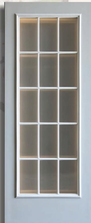
2/8 x 6/8 FIFTEEN LITE INSERT