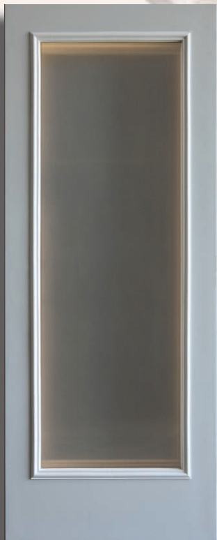
2/8 x 6/8 FULL LITE INSERT