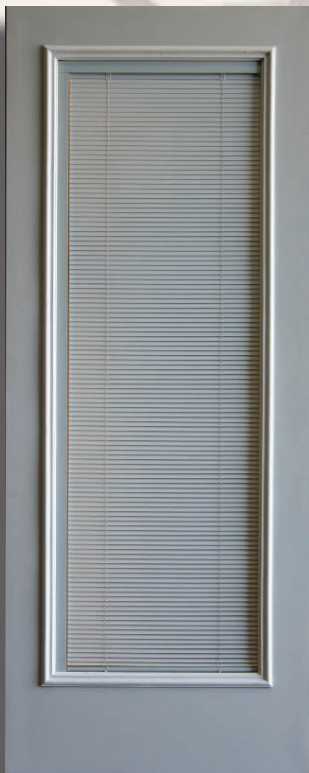
2/8 x 6/8 FULL LITE INTERNAL BLIND