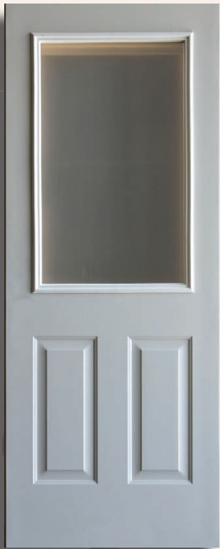
2/8 x 6/8 1/2 LITE INSERT