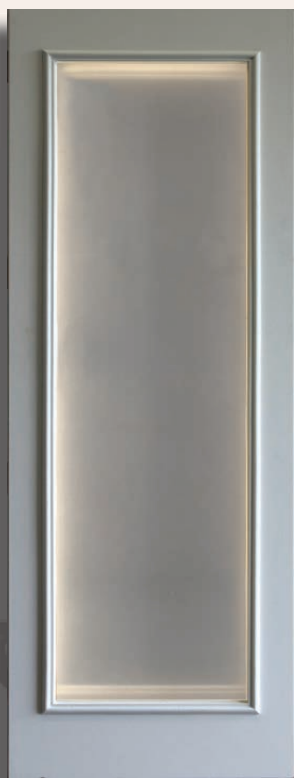
FULL LITE INSERT