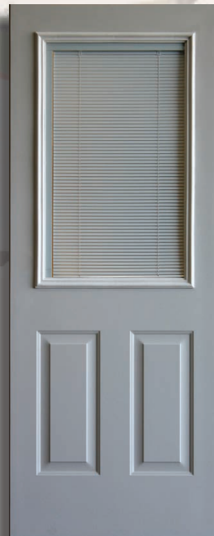
2/8 x 6/8 1/2 LITE INTERNAL BLIND