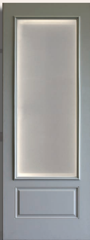
3/4 LITE INSERT