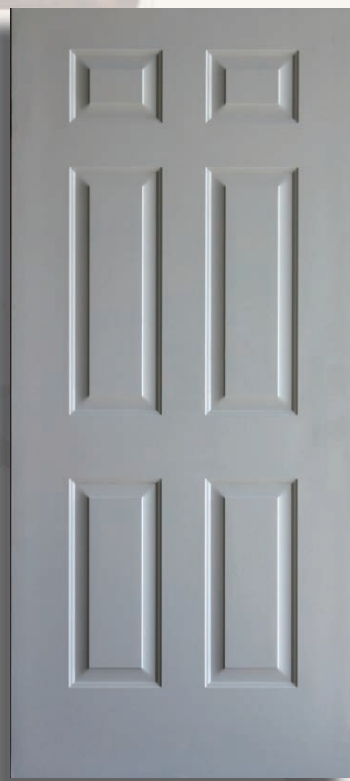
3/0 x 6/8 6 PANEL