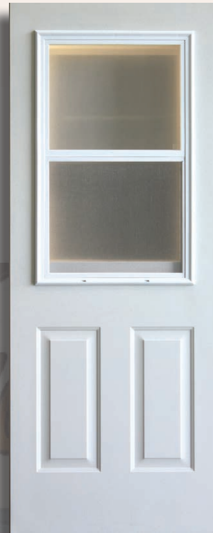
2/8 x 6/8 OPERABLE WINDOW