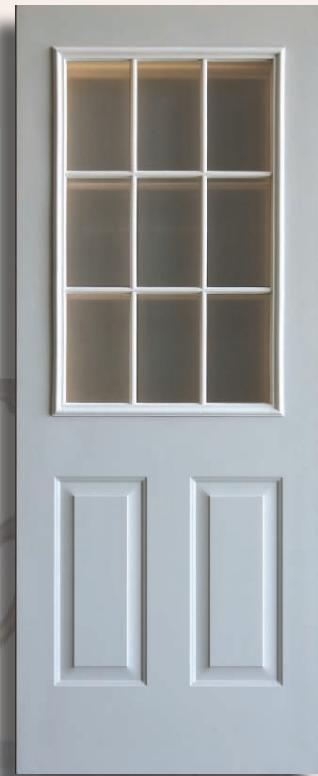
2/8 x 6/8 NINE LITE INSERT