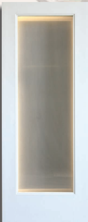
FULL LITE FLUSH GLAZE