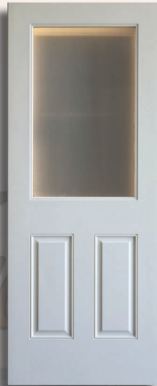
1/2 LITE FLUSH GLAZE