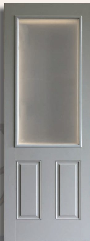
1/2 LITE INSERT